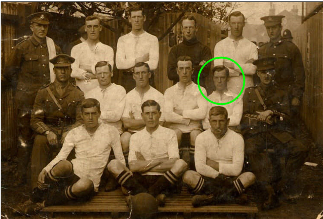
Footballers' Battalion 1916