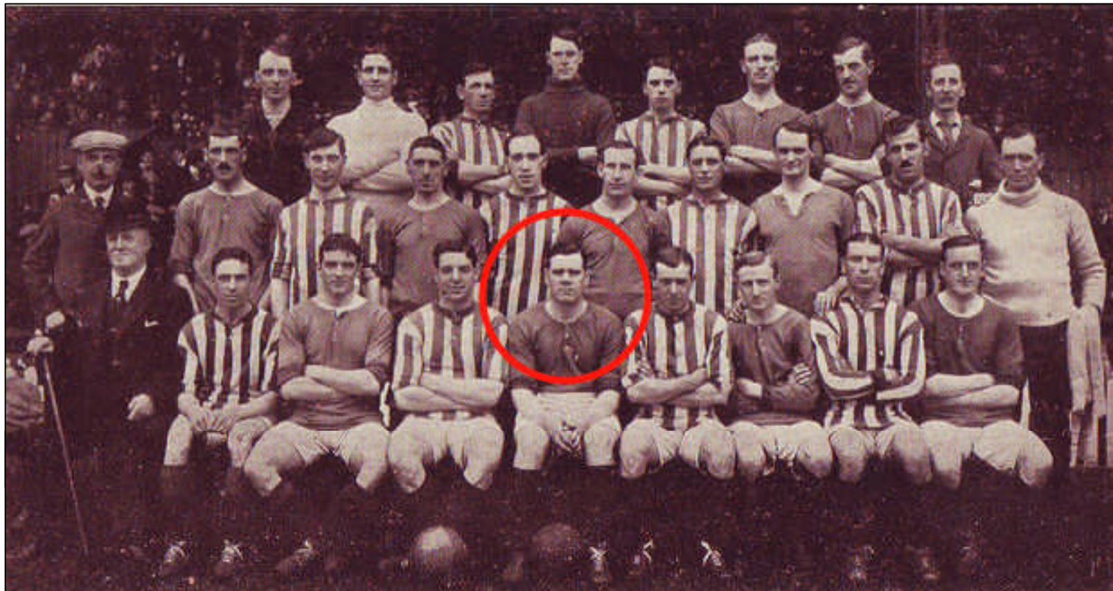
Manchester United 1914-15