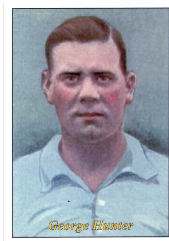
JF Sporting Collectibles 2003