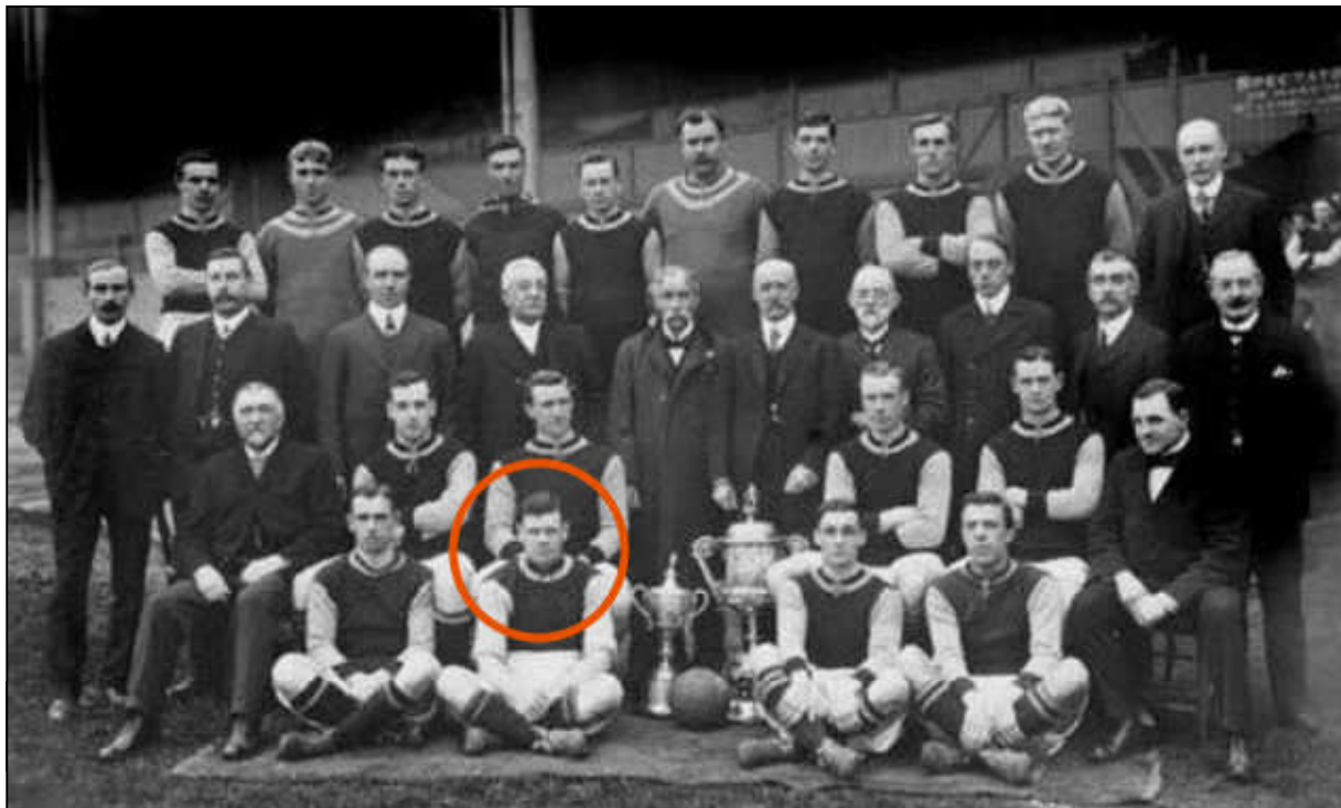
Aston Villa 1909-10