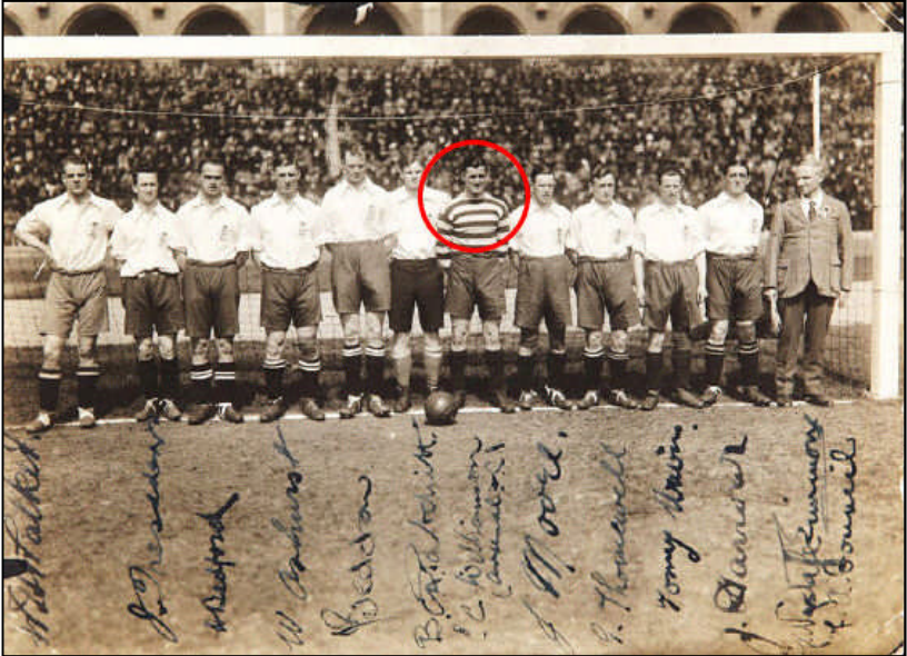
England v Sweden 1923 (First Match)