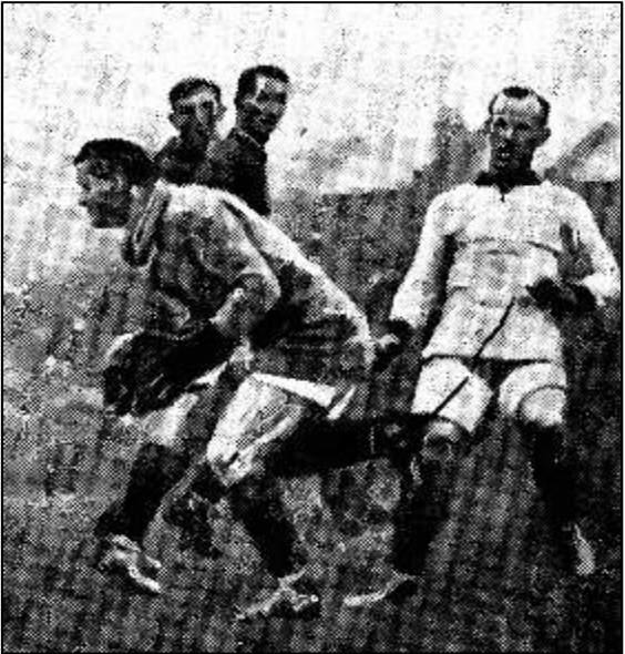
A save for Arsenal against Liverpool in 1922